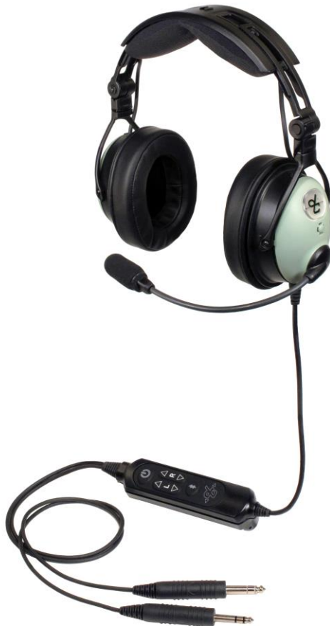
DC ONE-X Headset