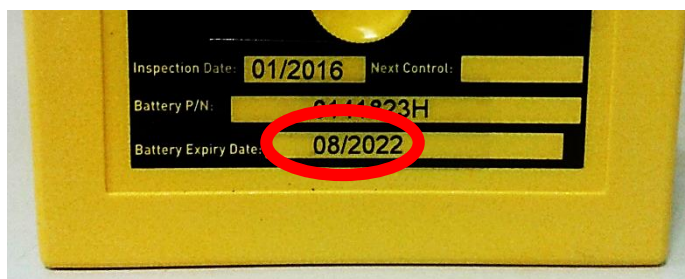
Battery expiry date on the ELT.