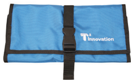
CP100 T3 Hanging Pouch

The generator has one RJ jack allowing you to test voice cables through a direct connection and identify video and data cables through the use of an adapter. The generator button turns the generator on, indicates tracing activity, and allows you adjust tone styles.