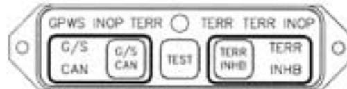
MD41-1348 | Honeywell Mark XXII PMA Pending